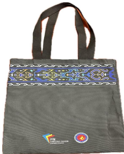
Canvas Tote Bag